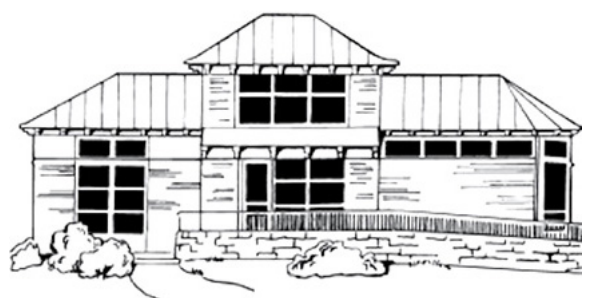
Color drawing by Heather White • Line drawing by Rhoda Boughton