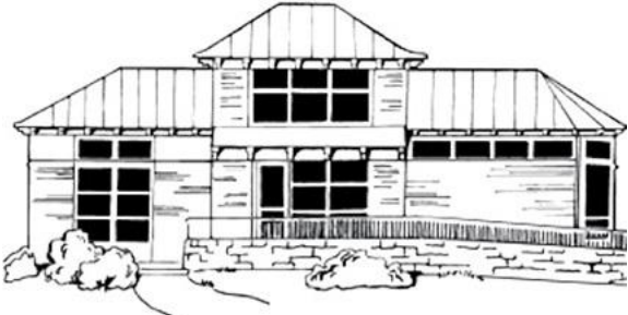
Color drawing by Heather White • Line drawing by Rhoda Boughton